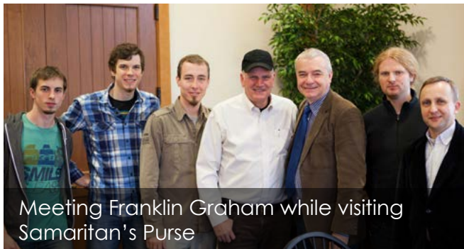
Meeting Franklin Graham while visiting Samaritan’s Purse

We had an opportunity to visit the “Billy Graham Library” – a museum worth visiting, indeed. We had tears in our eyes listening to the great multimedia message delivered by Billy in different situations, but wonderfully relevant even today! Also, on another day – we visited headquarters of Samaritan’s Purse, and met with Franklin Graham and his family. They are planning this year to ship 8.5 million “shoe boxes” (parcels with gifts of love) for children in