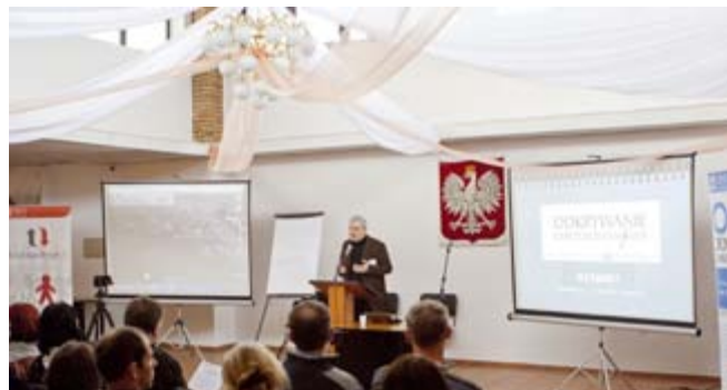
Christianity Explored training in Katowice